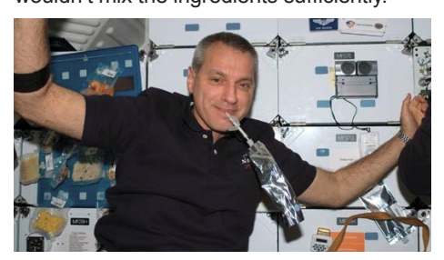
Astronaut Richard Linnehan sucks his morning bag of Kona coffee.

While you as a common earthling still ponder the use of either bottled vs tap vs filtered water for your brew, here's how it's being done in the heavens above: The space shuttle's orbiter fuel cells create water from hydrogen and oxygen gases. Parts are also recycled from used cabin air. It then gets heated in a suitcase-like food warmer. You can get water at room temperature, hot or lukewarm. But never chilled, so forget about ice coffee. Because of the absence of a fridge, only nonfat dried milk is available, because fat can potentially spoil. The coffee itself is in freezedried powder form already in a plastic coated metal foil pouch. Hot water is then pressed through a valved tube towards the coffee powder. Keep in mind, up there you are not sipping, you are sucking your coffee when ready! The pouch comes with a velcro strip so you can stick your drink to the wall, ceiling or even to your thigh. Sugar or artifical sweetener can be added, but our regular stir would do no good. Better hold the concoction in your hand and flap your whole arm up and down - rotating wouldn't mix the ingredients sufficiently.