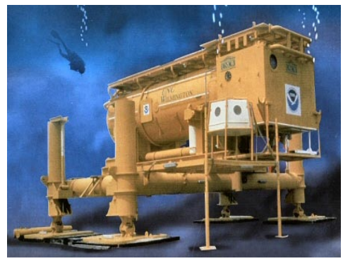
Owned by NOAA and managed by the University of North Carolina at Wilmington (UNCW), the AQUARIUS habitat is an 82-ton double-lock pressure vessel approximately 14 meters long by 4 meters in diameter.